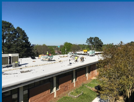
Complete Installation of White Cap at Building 2010A