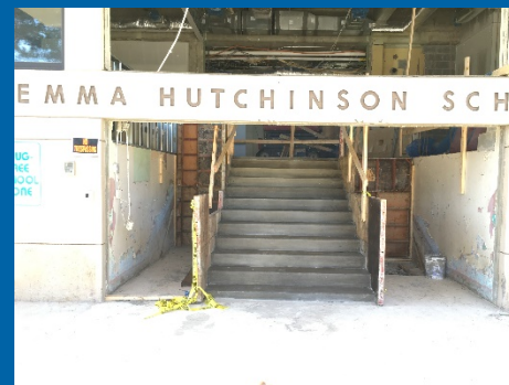
Form and Pour Entry Stair