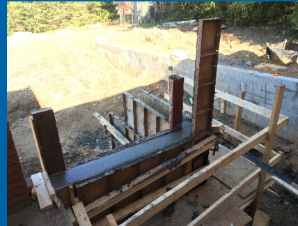
Form and Pour Exterior Stair Retaining Wall