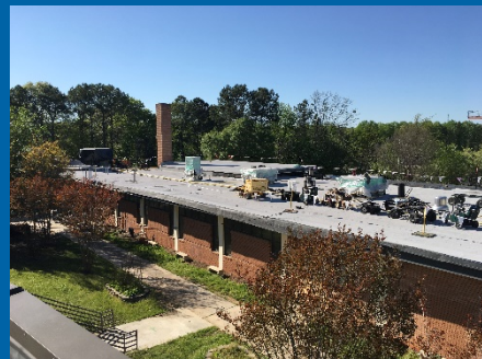
Complete Installation of White Cap at Building 2010B