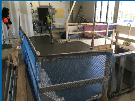
Pour Upper Entry Slab