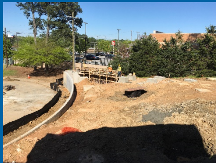
Complete ADA Ramp Retaining Wall and Canopy Footings